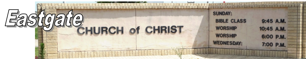
August 26, 2015

Beware lest your footprints on the sand of time leave only the marks of a heel. The trouble with stretching the truth is that it's apt to snap back.