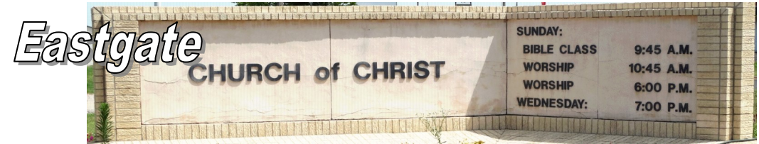
April 29, 2015

May 3 - May 9 Judges 17;1-18:-31 - 1 Samuel 5:1-7:17 John 3:1-21 - John 6:1-21 Psalm 104:1-23 - Psalm 106:13-31 Proverbs 14:20-21 - Prov- erbs 14:32-33